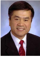
Gary Locke U.S. Secretary of Commerce U.S. Department of Commerce