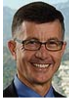
USRG Renewable Finance