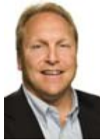
GE Energy Financial Services