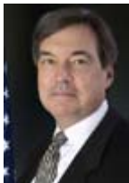
Jon Wellinghoff Chairman Federal Energy Regulatory Commission