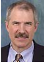
Committee on Energy and Natural Resources