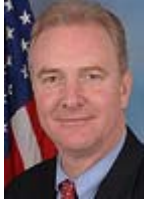
Chris Van Hollen U.S. Congressman (MD-8) U.S. Congress