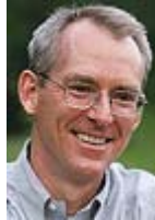
Bob Inglis Congressman (SC-4) U.S. Congress